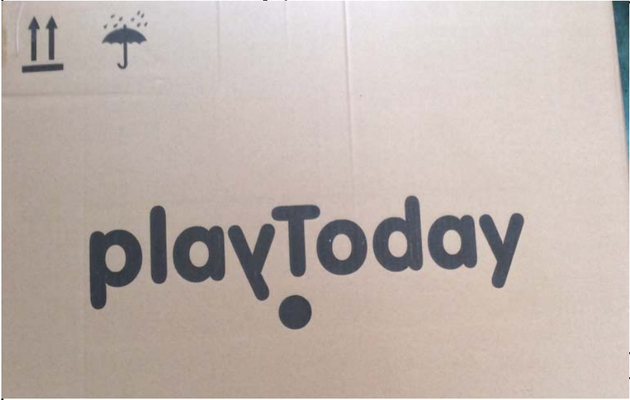
Main shipping mark