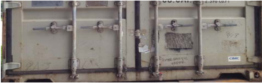
Container closed and sealed