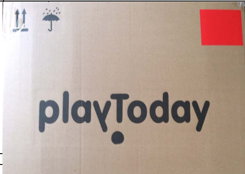
Main shipping mark