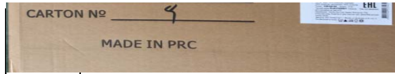
Side shipping mark