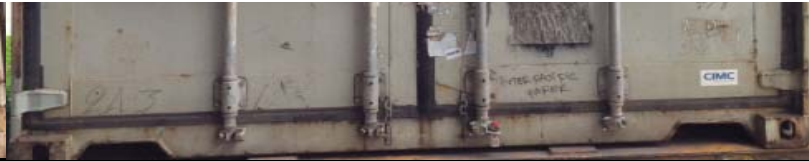
Carton No 00LU7767408