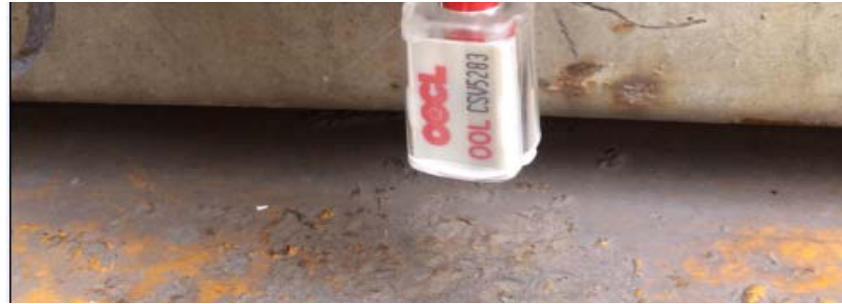
Container closed and sealed