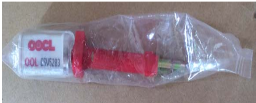
Seal No. 00LCSV5283