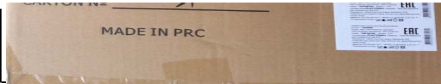
Side shipping mark